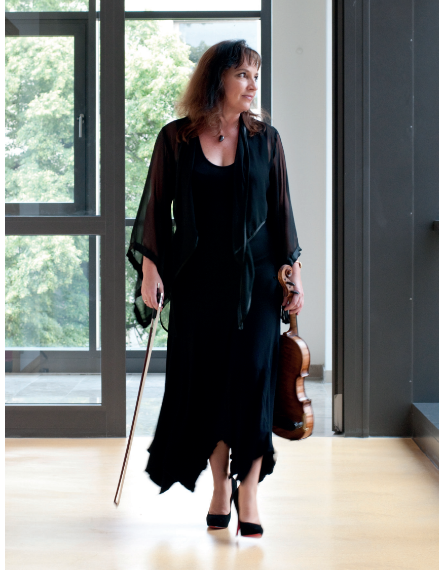
300 dpi, CMYK